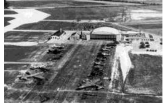
Building 1301 (1944)

History does not record the individual who first conceived of the idea of using an aircraft as a rocket launcher; however, experiments were being conducted in the United States during the early part of World War II with that concept in mind. Initial American efforts at developing air-launched rockets and missiles were located at a number of civilian and military installations across the country. The principal testing facility was the Aberdeen Proving Ground in Maryland with some of the coordination for the development being done at Wright Field in Ohio.