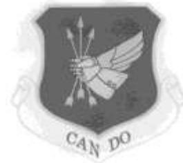
305th Air Mobility Wing