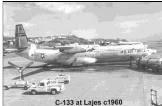
C-133 at Lajes c1960