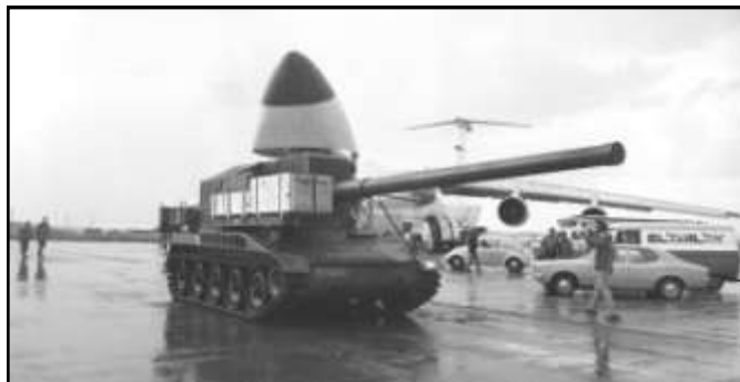
Photo: Tank off-loaded from a C-5 at Lod Airport, Tel Aviv