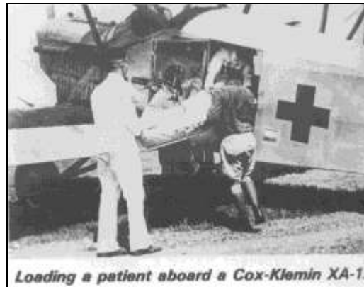
Loading a patient aboard a Cox-Klemin XA-1.

The crash, however, did not deter Colonel Truby from developing the concept of aeromedical evacuation further. He envisioned the employment of air ambulances in peacetime at Air Service stations for crash rescue work and for transporting patients from isolated stations to larger hospitals. During wartime, air ambulances would transport the seriously injured from the front to base hospitals and would also fly in emergency medical supplies. Truby advocated procuring three different types of planes: a small plane capable of landing under austere conditions; a medium-sized plane that could navigate across the country and a large plane that could transport several patients.