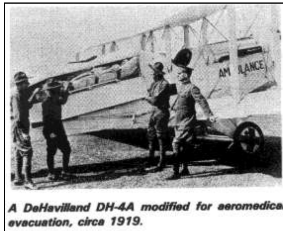
A DeHavilland DH-4A modified for aeromedical evacuation, circa 1919.

The crash, however, did not deter Colonel Truby from developing the concept of aeromedical evacuation further. He envisioned the employment of air ambulances in peacetime at Air Service stations for crash rescue work and for transporting patients from isolated stations to larger hospitals. During wartime, air ambulances would transport the seriously injured from the front to base hospitals and would also fly in emergency medical supplies. Truby advocated procuring three different types of planes: a small plane capable of landing under austere conditions; a medium-sized plane that could navigate across the country and a large plane that could transport several patients.