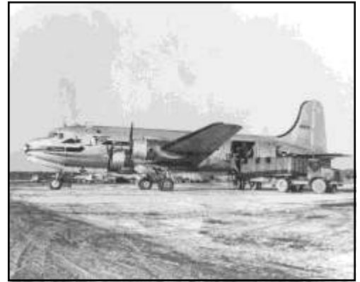
Pictured: the museum's Douglas C-54M during the Berlin Airlift.