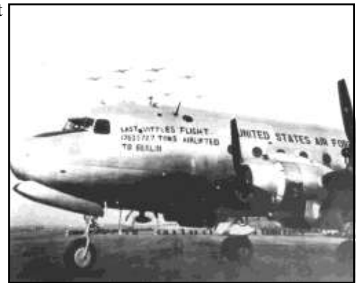
Statistics on the nose of a MATS C-54 tells part of the story of the Berlin Airlift.