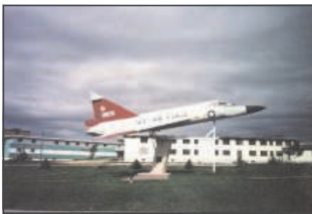
F-102 Memorial presented to the town of Stephenville by the USAF in commemoration of Harmon AFB, July 21, 1990

On 16 December 1966, Harmon Air Force Base officially closed and all buildings and facilities were turned over to the Canadian Federal Government. A Federal-Provincial Board was set up to determine how to best utilize all of the buildings and areas.