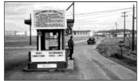
Harmon's Main Gate c1950