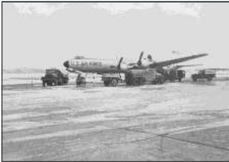
C-118 from McGuire AFB c1956/57

In 1953, like all other bases and sites in Newfoundland and Labrador, Ernest Harmon became a part of the Northeast Air Command (NEAC). Its mission was to participate in the supply and servicing of all US Installations in NEAC, including American bases in Greenland and Baffin Island. Ernest Harmon retained its importance as the first major overseas stop for military aircraft flying the North Atlantic to Greenland, England and Europe. The Strategic Air Command (SAC) operated out of Harmon from 1953 to 1958. However, in July 1953, the NEAC force increased considerably as the 61 st Fighter Squadron with twelve F-94B's arrived at Harmon AFB. Three fighter squadrons were the most that NEAC ever had, although at one time there were plans for five squadrons (two at Goose, one each at Harmon, Thule and Argentina). All the squadrons eventually converted to F-89D's.