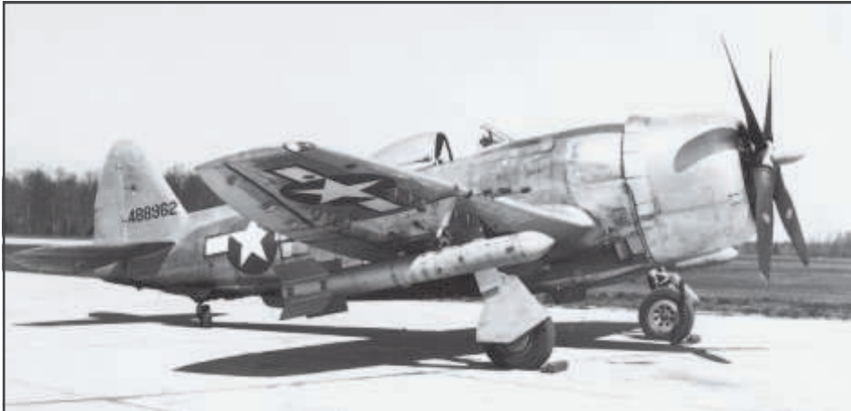
A P-47 assigned to the 4146th Army Air Force Base Unit, Dover Army Air Field. It was that unit that developed the first successful combat proven air-launched rocket systems used by the United States Armed Forces in World War II.