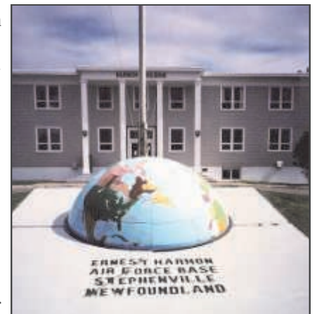
4081st Strategic Wing Headquarters. Now the Harmon Building

Command Headquarters for the 64 th Air Division was located at Pepperell Air Force Base; however, Ernest (Continued on the following page)