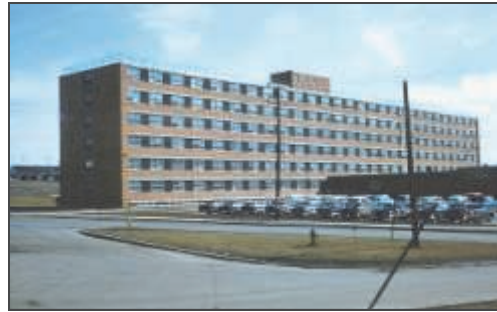
Harmon Hilton 1960

Harmon as the nearest refueling stop. A new range of large military bombers, jet fighter aircraft and in-flight tanker refueling aircraft came into being. For the next eight years Ernest Harmon Air Force Base flourished as a strategic part of the NORAD Air Defense program. However, all good things eventually come to an end, as in 1965 when the deactivation of Harmon AFB was announced. Up to the time from 1957 over 5,000 United States Air Force personnel were stationed at Harmon. The annual operating costs for the base were about $17 million in 1962. Salaries for both military and civilian personnel amounted to more than $1 million a month. The total value of Ernest Harmon Air Force Base, at the time of closing, was estimated at $179 million.