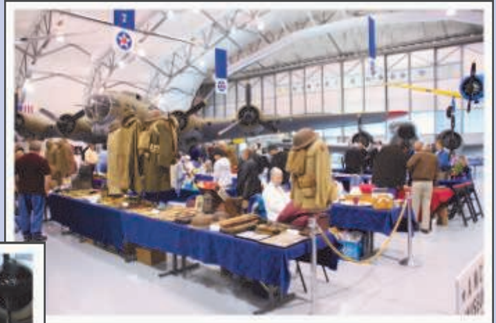
RIGHT: Collector's Day at the Museum. Items displayed included: trench art, antique Teddy Bears and toys, china, uniforms, unusual woodworking tools, antique watches and other collectables.