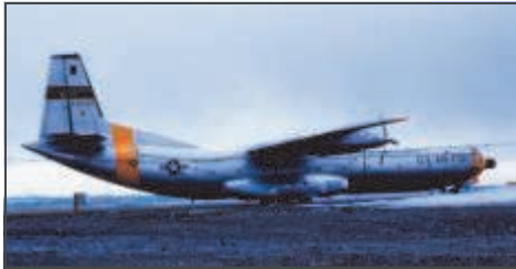
Dover AFB's C-133A #62002 at Harmon AFB in April 1961. It would be lost at sea in September of 1963.

A great feeling of anxiety hung over the approximately 1,200 civilians who worked on the base, when in 1958 the Northeast Air Command announced it was being deactivated. However it was learned that the base operations would continue under the new command of the 64 th Air Division. This change in command for Harmon revitalized the base, as a new multi-million dollar expansion program was announced. The two Harmon Hilton dormitories, at a cost of approximately $2 million each, including the center core, a new hospital and additional Officer's Quarters were only a part of the new construction program.