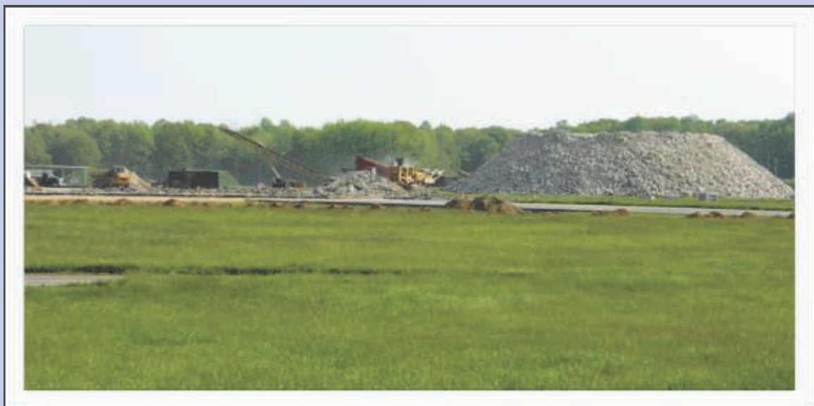
BELOW: A view looking over the Museum's fence shows a section of Dover's Runway 14/32 (seen as a pile of rubble). The 2½ mile runway (asphalt & concrete) is undergoing a total replacement. Portions of this runway date back to World War II when the base was used for P-47 pilot training, anti-submarine warfare, tow target training and as a rocket test center.