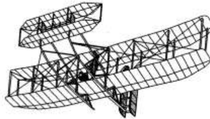
December 17, 1903